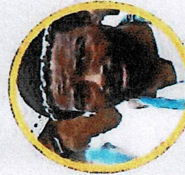
Amathembu King Buyelekhaya Zvelibanzi Dalindyebo