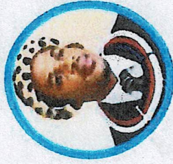
Amandebele Wakwa Ndzundza King Mabhoko III Mpumalanga Province