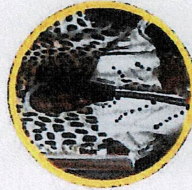
Amakhosa King Zvelonke Sigcavu