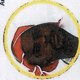
Amalimpondo King Zanoluko Tyelovuyo Sigcavu