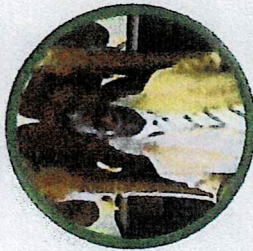
Vha Venda from the lineage of Mphephu Ramabulane Limpopo Province