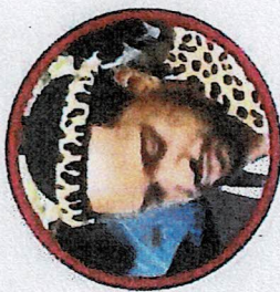
Amazulu King MisizuluZulu KwaZulu-Natal

The practical expression of our past and injustice is the obligation of every individual. The authority of the government or state is derived from the constitution and the bill of rights. The King is a King with the land, and once the King loses land, he forfeit his Kingdom. The state power shall start with the Kings.